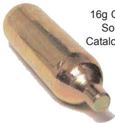
16g CO 2 Cartridge Sold Separately Catalog #: 59-155